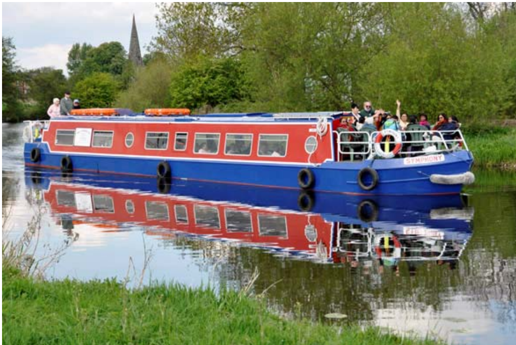
Symphony out with a cheerful party in the beautiful countryside. She carries up to twenty-six people each day between April and October