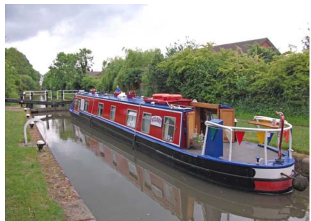
Melody in a lock. There are lifts at the bow and stern for easy wheelchair access.