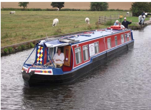
A family cruising on Melody during the Summer. She takes a family or group of up to eight people on a self-hire basis.