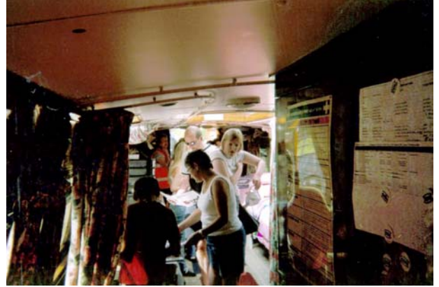
Browsing for souvenirs