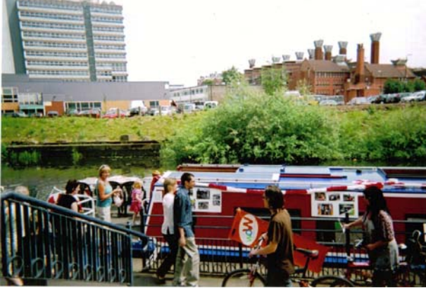
A prominent berth at the bottom of the steps leading down to the towpath.