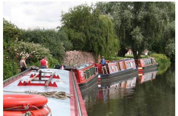
Four of the Canadian flotilla in line astern – 'Melody' is the second boat. Note the Canadian flags!