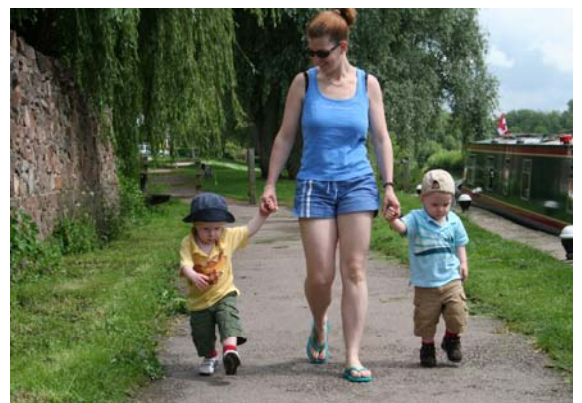
Two determined youngsters