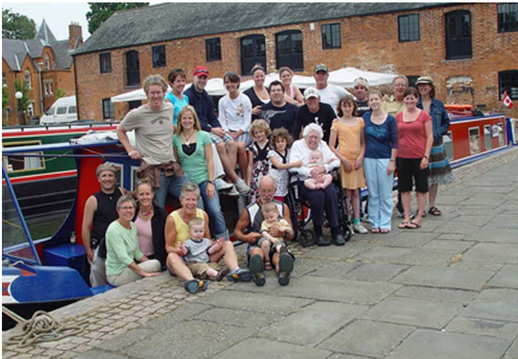
All twenty seven members of the Canadian party gathered together